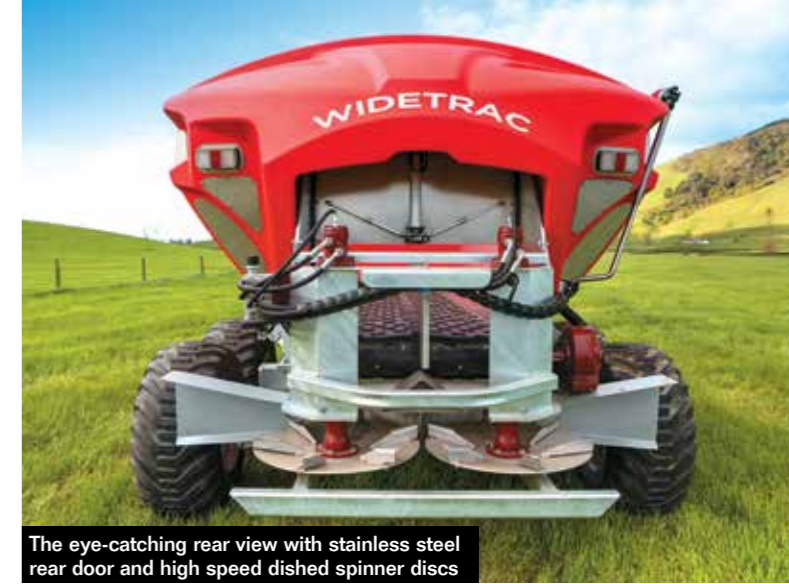
The eye-catching rear view with stainless steel rear door and high speed dished spinner discs