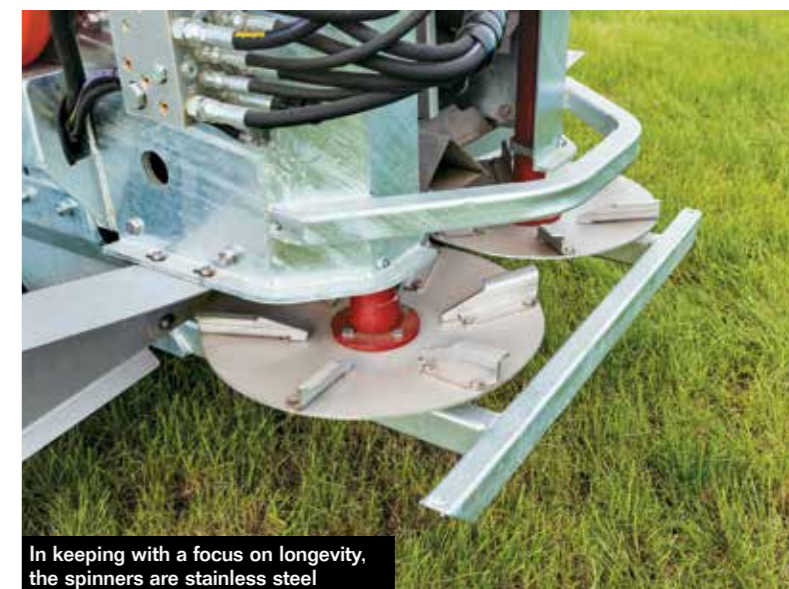
In keeping with a focus on longevity, the spinners are stainless steel