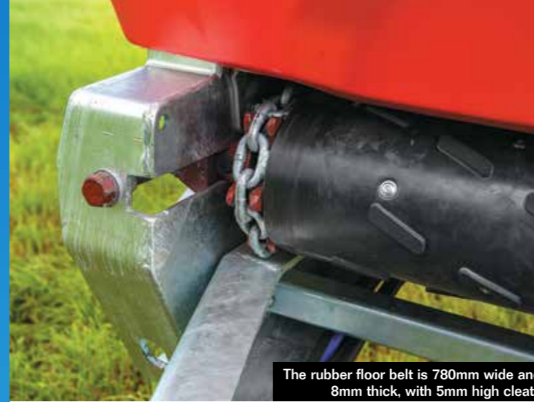
The rubber floor belt is 780mm wide and 8mm thick, with 5mm high cleats

"There's no denying that the WideTrac makes a strong first impression because of its stylish plastic body," says Giltrap Engineering