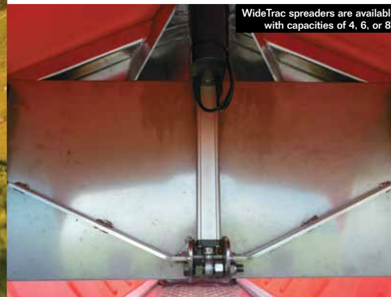
WideTrac spreaders are available with capacities of 4, 6, or 8T

The WideTrac provides a simple, affordable way for farmers to apply fertiliser accurately so they can meet those compliance regulations