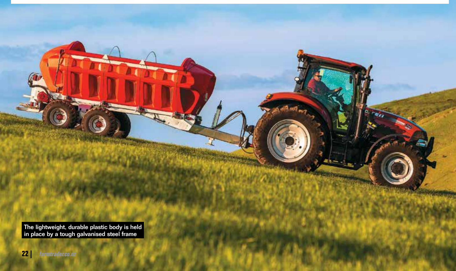
The lightweight, durable plastic body is held in place by a tough galvanised steel frame

The WideTrac provides a simple, affordable way for farmers to apply fertiliser accurately so they can meet those compliance regulations