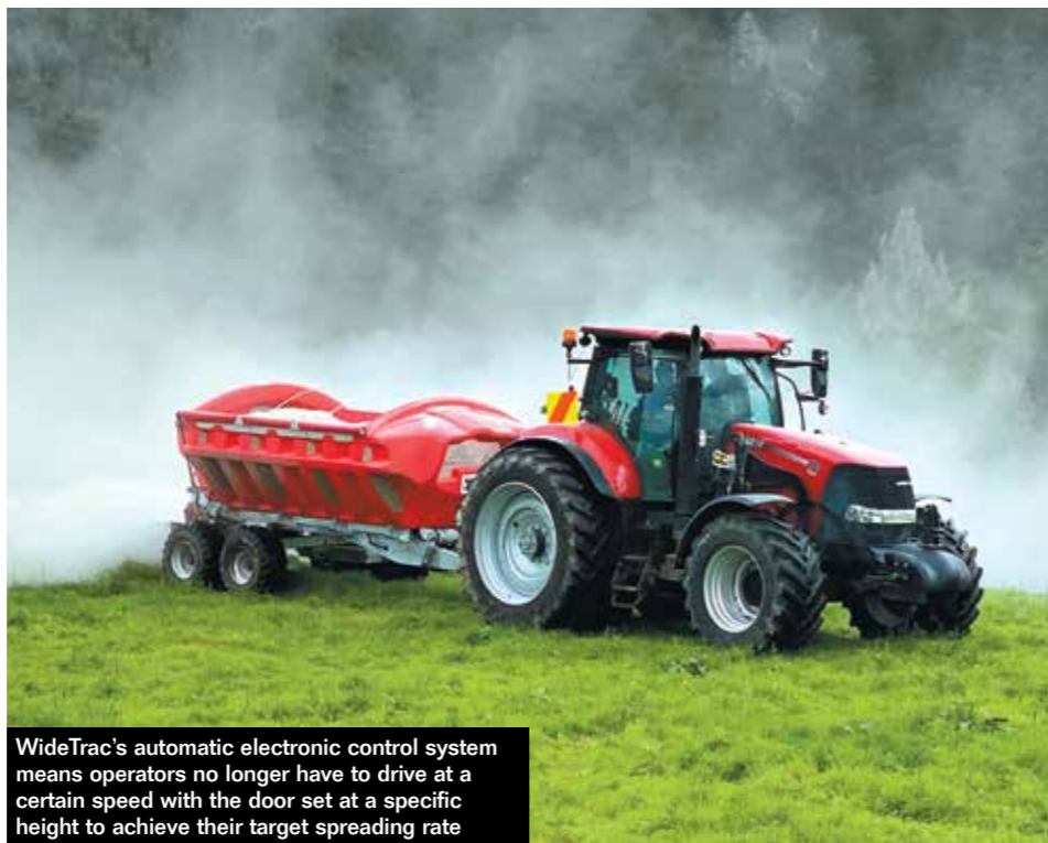
WideTrac's automatic electronic control system means operators no longer have to drive at a certain speed with the door set at a specific height to achieve their target spreading rate

One of the most notable points sure to find favour is the fact the WideTrac's automatic electronic control system means operators no longer have to drive at a certain speed with the door set at a specific height to achieve their target spreading rate. While in hindsight this seems an obvious feature for a fertiliser