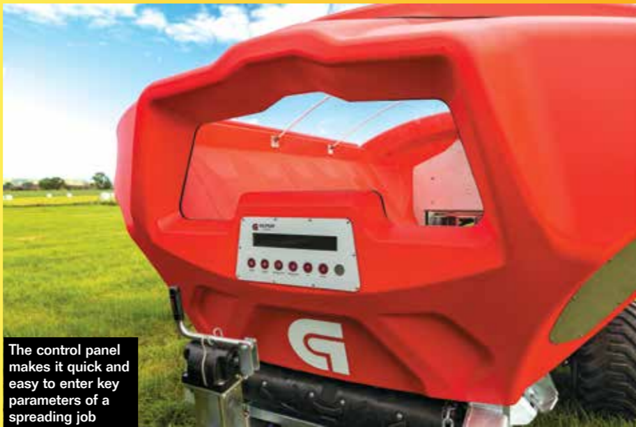
The control panel makes it quick and easy to enter key parameters of a spreading job

"It's really that simple," says Eric. "The control panel has a display screen that lets