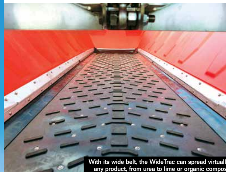
With its wide belt, the WideTrac can spread virtually any product, from urea to lime or organic compost