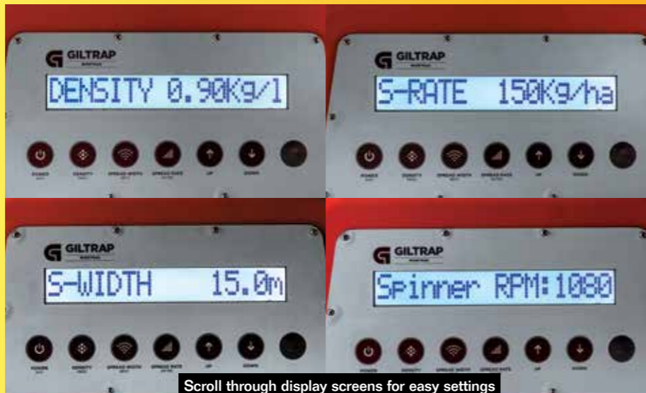
Scroll through display screens for easy settings