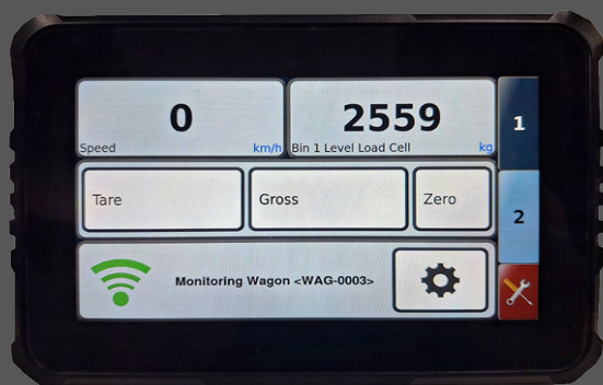
CANBUS TRACTOR SCREEN

- Only available on the CANBUS touch screen system. Upgrade to wireless scales with three different feed rate control modes. The load in the wagon is displayed in kg with scale functions at your fingertips. To feed out simply enter a percentage feed rate, or the amount you want to feed in kg, or your total feed run length and how much you want to feed out. The wagon does the rate control calculation and discharges the load as required, automatically shutting off at the end of the run to eliminate over-feeding.