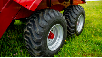
Upgrade to 400/60-15.5 wheels for improved flotation and traction