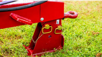
Quick Hitch Stand. Used with a Giltrap Quick Hitch for fast hitching. The large foot reduces the chance of sinking in soft ground