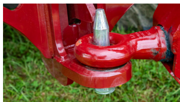
Tow pin. The wagon tow eye rests on a wear resistant plate