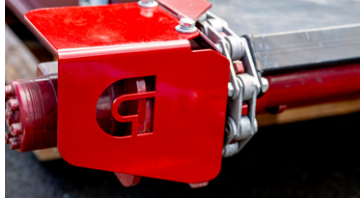
Chain and Slat conveyor. The belt conveyor is easily converted to a chain conveyor. Ideal for use with large square bales or beet. Excellent tracking and low maintenance