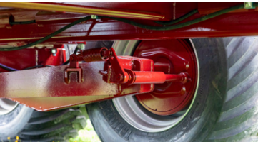
Front axle brakes for added safety