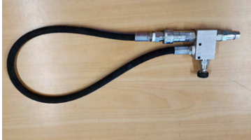
Brake line pressure relief valve for remote service actuated brakes