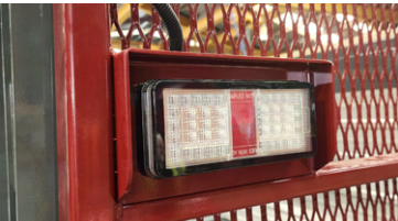
LED Tail Light Kit