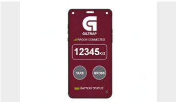
Phone based scale system with manual floor control (See previous page)