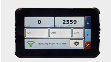
CANBUS electronics options (See previous page)