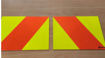
Overwidth panels on gate. Improved safety with better visibility on the road