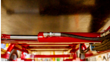
Conveyor belt auto shift ram extends the conveyor past the wheels to reduce the chance of running feed over