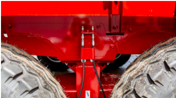
Remote Axle Greasing Kit for simple maintenance