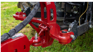
Clevis linkage pins mount the Quick Hitch securely to the tractor