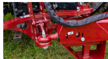
Smart design allows for tight turns