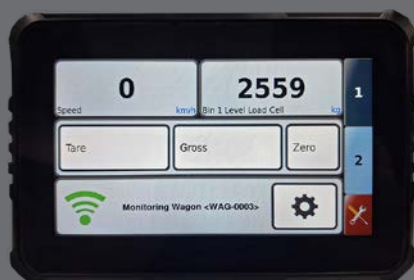
CANBUS TRACTOR SCREEN

The robust scale design is configured with either 4 or 6 industrial shear beam load cells and heavy-duty mounts for durability and long life. Bespoke stainless steel convex/concave pivot washers ensure accurate scale readings on the move.