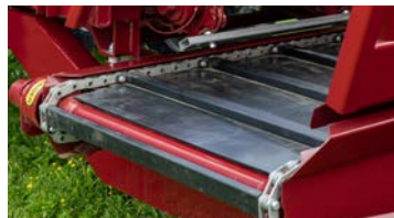
Chain & slat conveyor