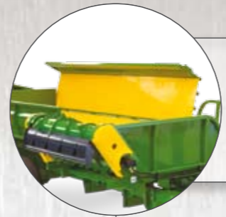
Adjustable side for 8' bales